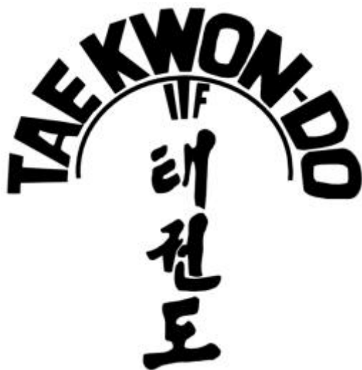
Official ITF Tree logo