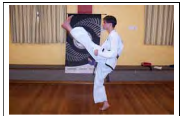
Figure 6: Side Rising Kick :

This will stretch your back hamstring and make it easier for front kicks and downward kicks. Keeping your leg straight and toes pulled back, and when your leg has risen up try and bring it down as slow as you can.