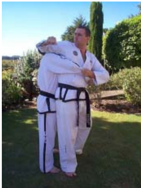
3. Horizontal backward elbow strike.