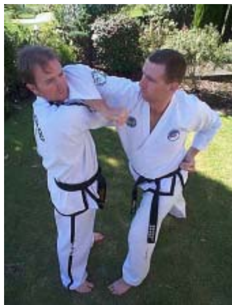
4. Pivot into left walking stance and counter attack with a “Front Elbow Strike” or “Reverse Knife Hand Strike” and Ki-Hap!