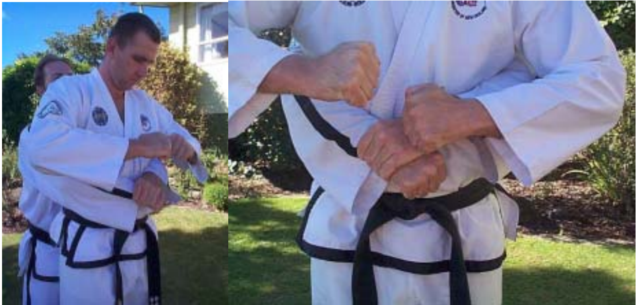
2. Repeatedly strike with middle knuckles on back of opponent's hands.