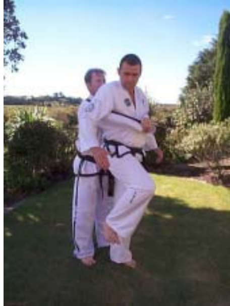
1. Preliminary stamp on foot/shin.