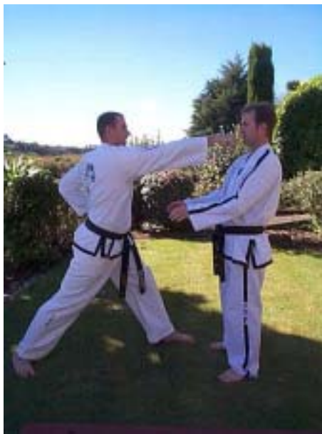
4. Counter attack with a fore fist punch ( ie. Right L-stance, right fore fist punch and vice versa )