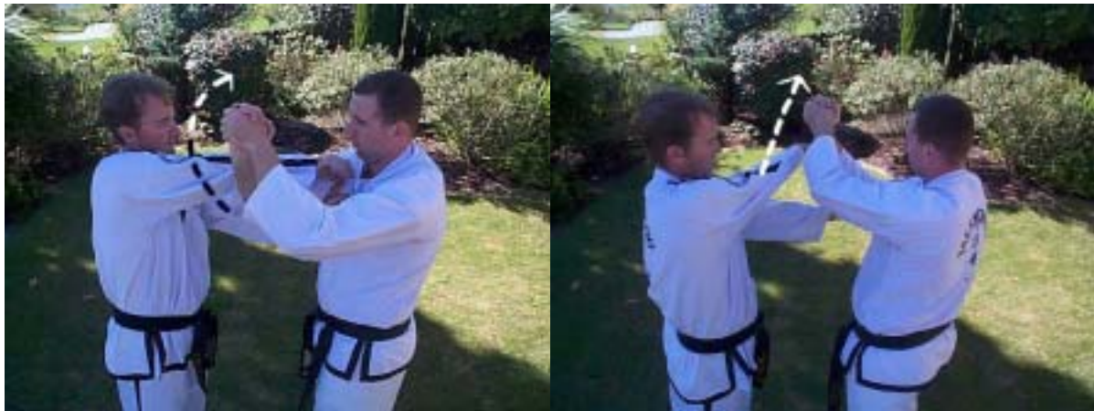
3. Lift upwards then push and pull your hands whilst rotating simultaneously clockwise across the front of your body whilst stepping into a right walking stance.