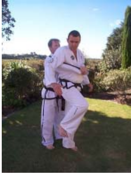
1. Preliminary stamp on foot/shin.