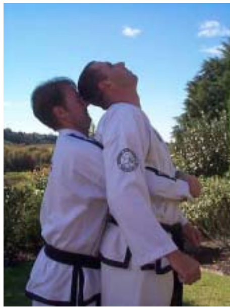
2. Headbutt backward.