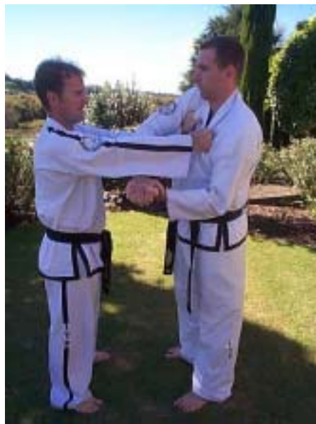
2. Grabbing your right hand with your left hand.