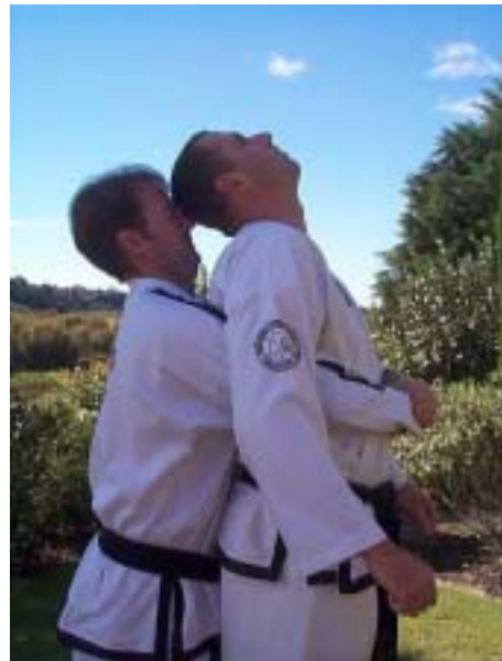
2. Headbutt backward.