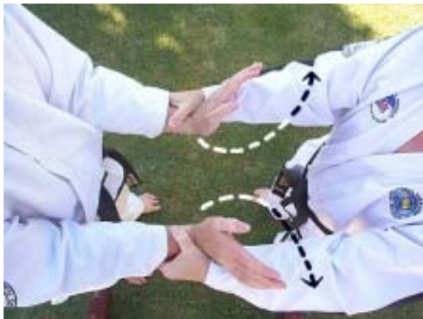
1. Move both wrists in an outward circular motion until both knife-hands are on your opponent's wrists or inner forearm.